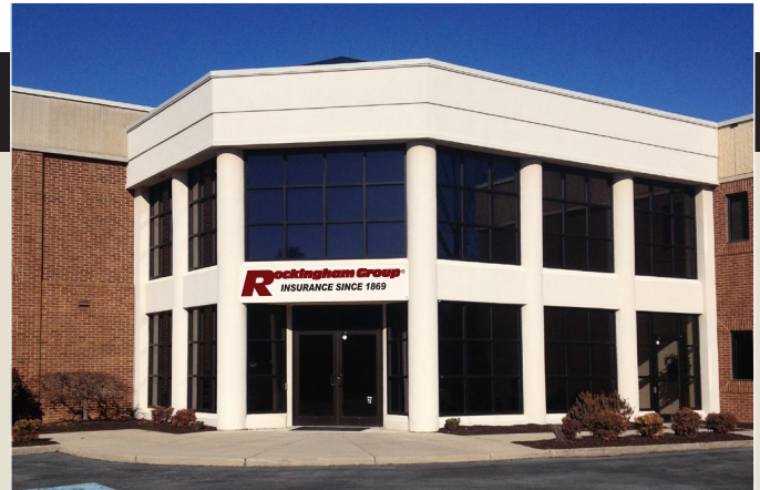
Corporate Office, Harrisonburg, Virginia

We provide coverage for unusual and difficult insurance needs as well as auto and property insurance for US expatriates.